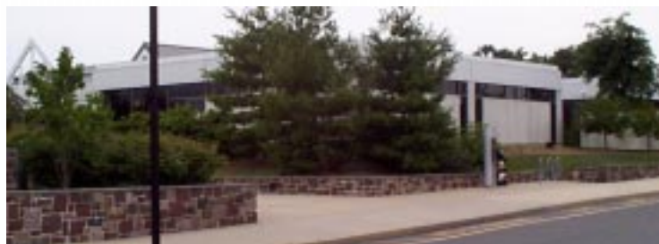
The Plainsboro Library