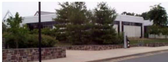
The Plainsboro Library